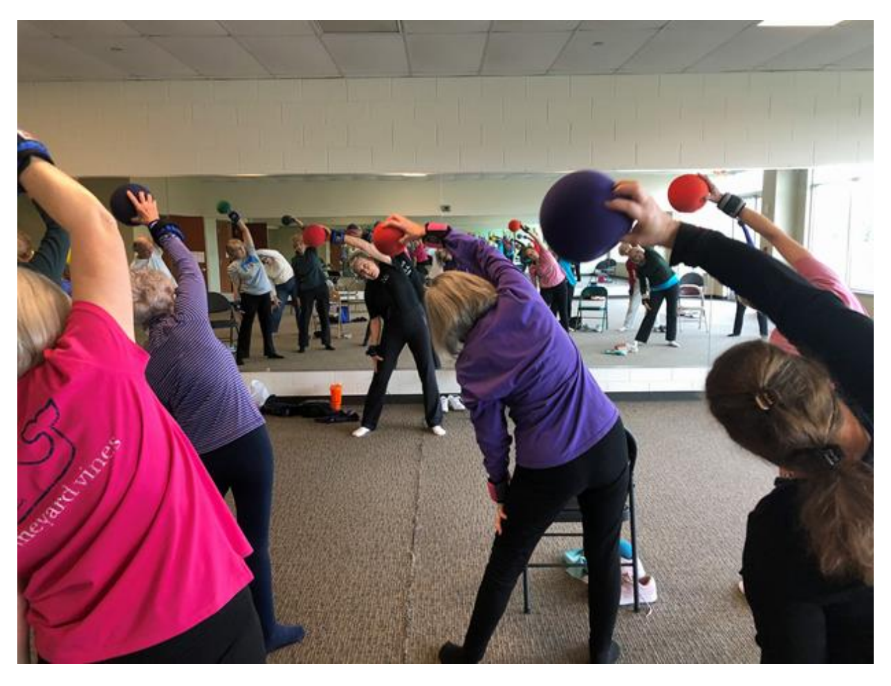
Exercise classes are for all ages and are especially helpful for the elderly